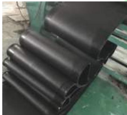
CONVEYOR BELT RUBBER