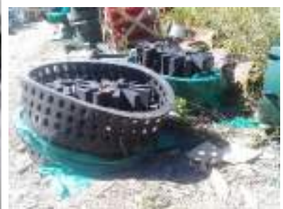
HICOR SUPPLIED RUBBER MINING PARTS