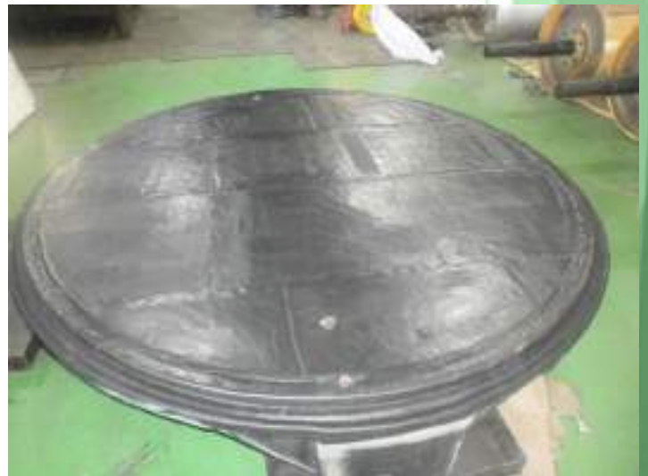
72" DIA BUTTERFLY VALVE RUBBER RELINING