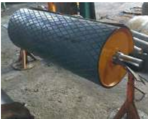
PULLEY RUBBER LAGGING